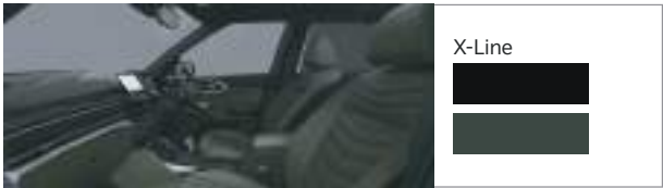
Xclusive Two-tone Black and Splendid Sage Green Interiors