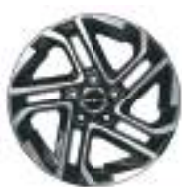
R16 - 40.62cm (16") Dual Tone Crystal Cut Alloys with Black Gloss Centre Cap