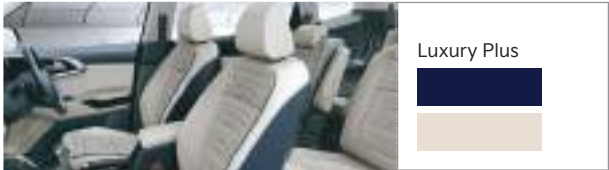
Opulent Two-tone Triton Navy & Beige Interiors