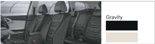
Regal Two-tone Black & Beige Interiors with Indigo Accents