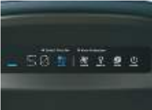
First in class

**Not a part of X-Line interior color theme.