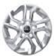
R16 - 40.62 cm (16") Steel Wheel with Full Size Wheel Covers