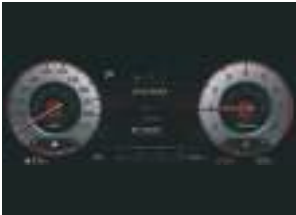
First in class