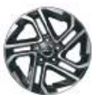
R16 - 40.62 cm (16") Dual Tone Crystal Cut Alloy Wheels