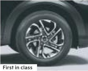
First in class