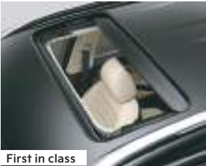
First in class