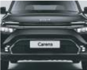
Kia Signature Tiger Face with Digital Radiator Grille