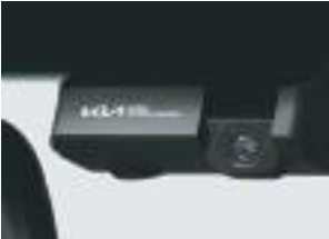
First in class