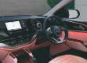
First in class