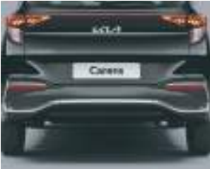
Chrome Rear Bumper Garnish with Diamond Knurling Pattern