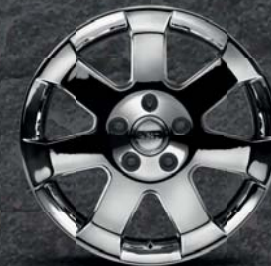
18" Mopar designed chrome plated alloy wheel