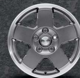
17" Mopar designed aluminium painted alloy wheel