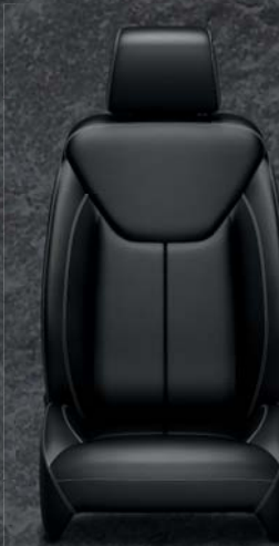
Black Leather Standard on Overland