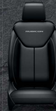
Black Leather Standard on Rubicon