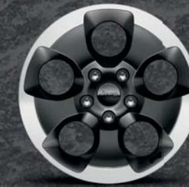
18" alloy wheel Standard on Rubicon