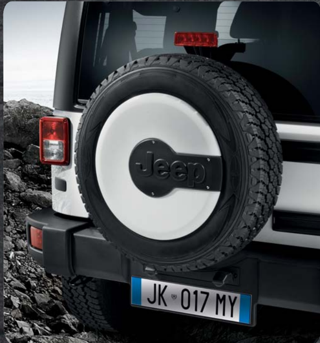
Spare tyre cover.