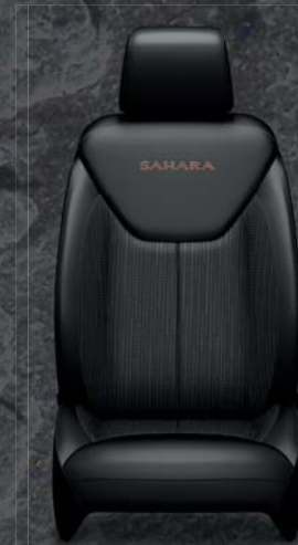
Black Cloth Standard on Sahara