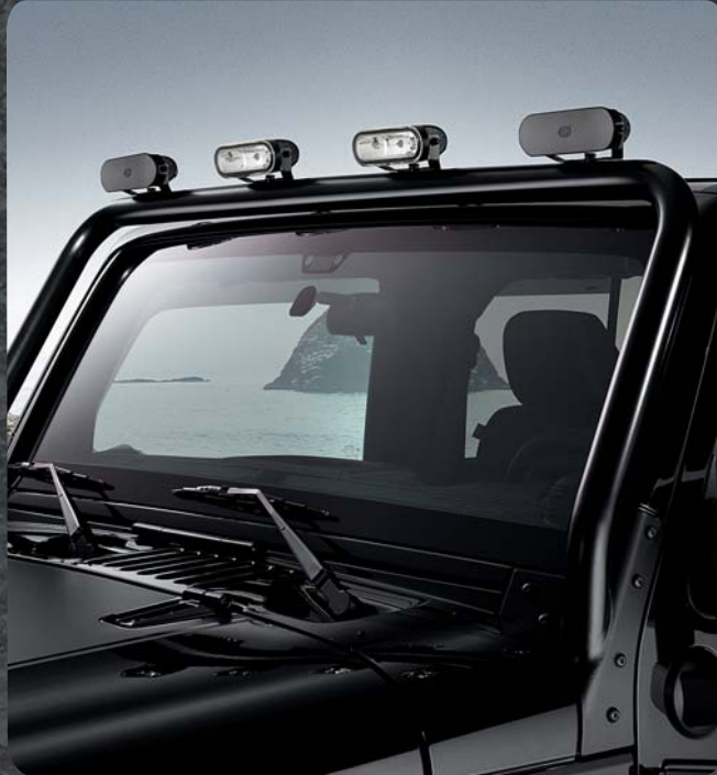
Windshield mounted lightbar. Black coated with preparation brackets for 4 lights.*