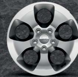
18" alloy wheel Standard on Sahara & Overland