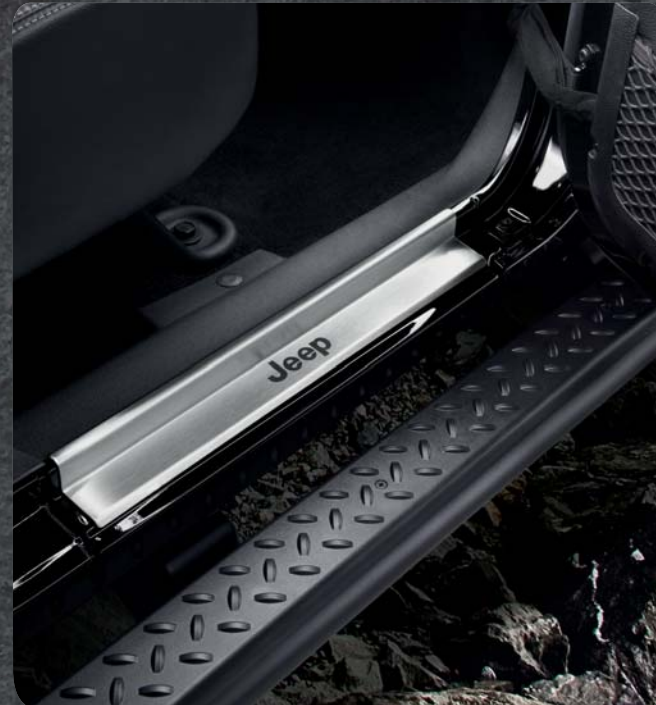
Door sill guard in brushed stainless steel with Jeep® logo.