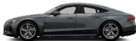
Daytona Grey Pearl Effect 6Y6Y €1,348

For more colour options please visit audi.ie