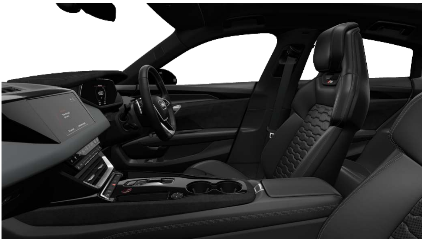
Black-Grey/Black Leather Interior (Option Code KH)

Note: Offered in conjunction with RS Design Pack - Red (Option Code PEF)