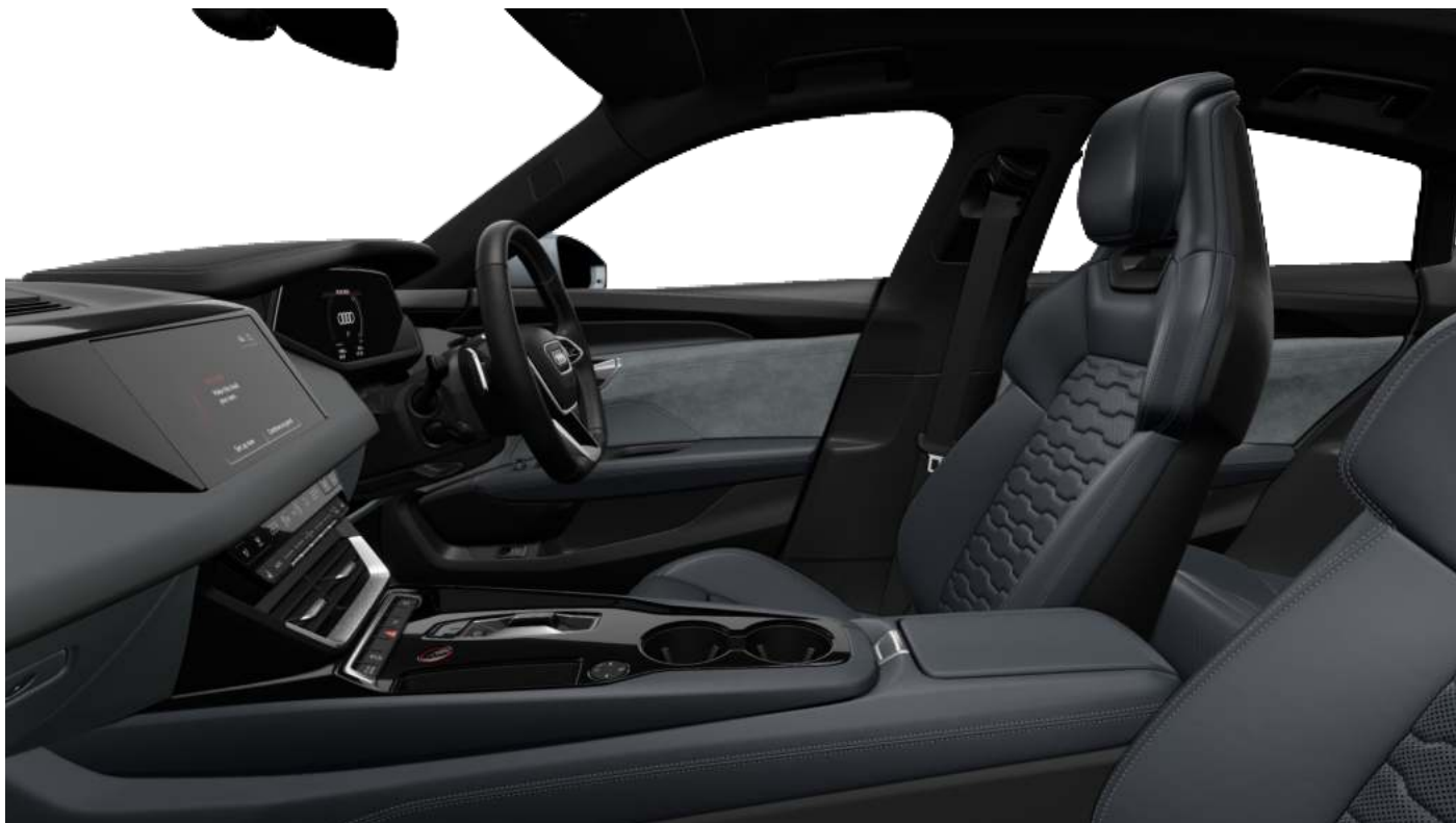
Monaco Blue-Steel Grey/Black-Grey Leather/Synthetic Leather Interior (Option Code FQ)