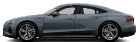
Kemora Grey Metallic 8R8R €1,348