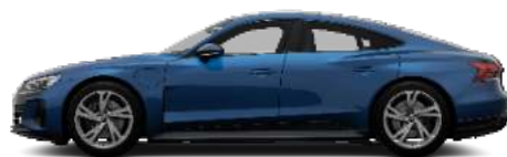
Ascari Blue Metallic 9W9W €1,348