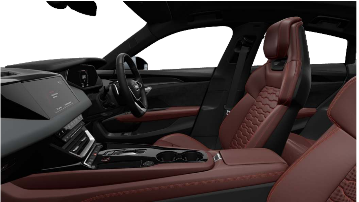
Arras Red-Crescendo Red/Black-Red Leather/Synthetic Leather Interior (Option Code FO)