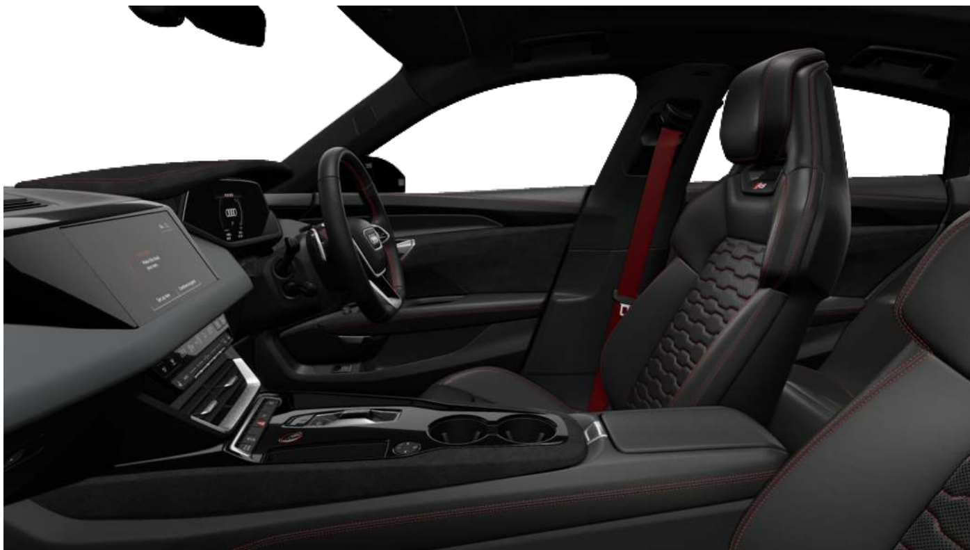
Black-Express Red/Black Leather Interior (Option Code AR)

Note: Offered in conjunction with RS Design Pack - Red (Option Code PEF)