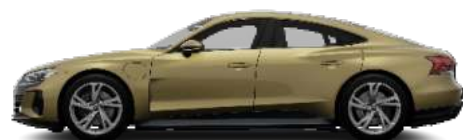
Tactical Green Metallic V0V0 €1,348