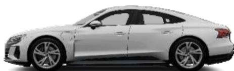
Ibis White Solid T9T9 €0