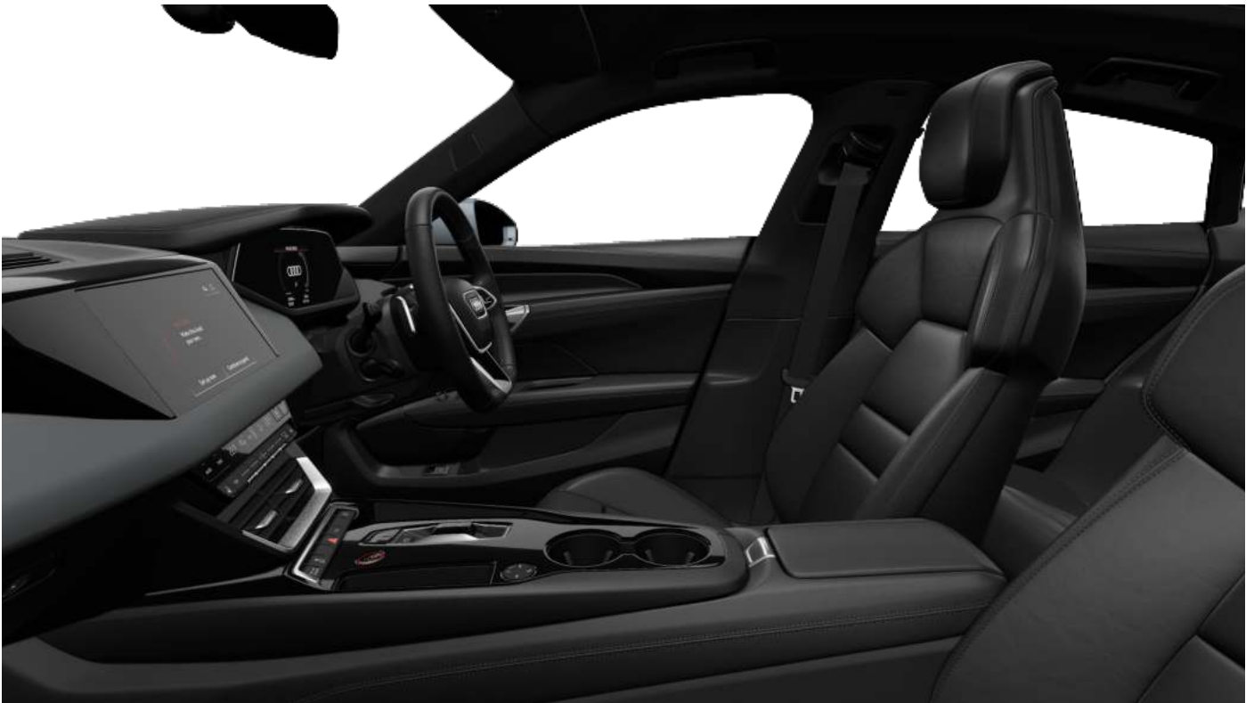
Black/Black Leather/Synthetic Leather Interior (Option Code JN)