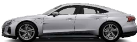
Floret Silver Metallic L5L5 €1,348