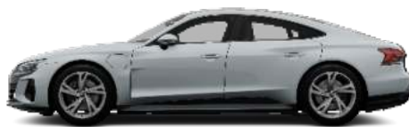
Suzuka Grey Metallic M1M1 €1,348