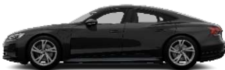
Mythos Black Metallic 0E0E €1,348