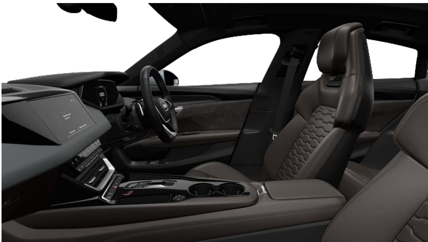
Sard Brown/Black-Brown Leather/Synthetic Leather Interior (Option Code FI)