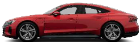
Tango Red Metallic Y1Y1 €1,348